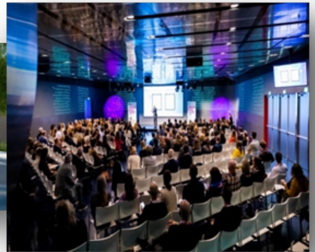
The conference centre in Utrecht, Jaarbeurs