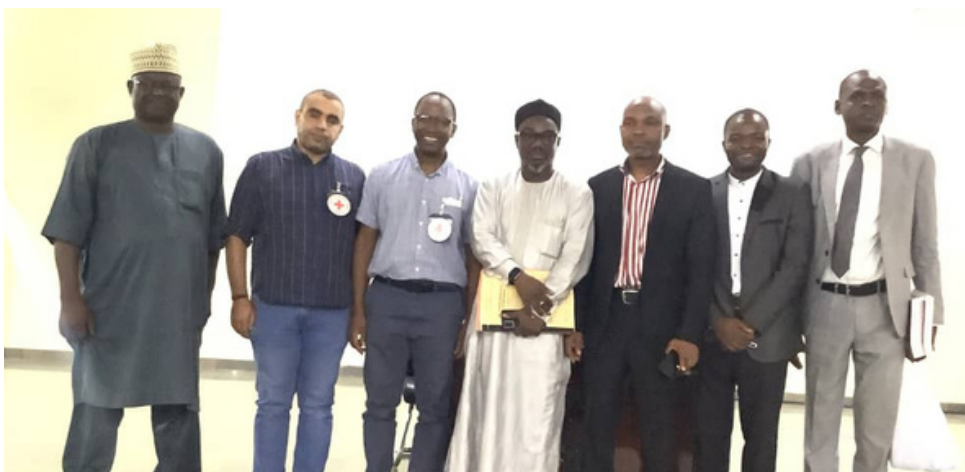
Speakers with some members of the Hospital management team and the ICRC, Maiduguri